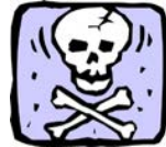
extinction of over 90% species

Circle the animals that survived the extinction