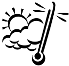
2nd temperature increase +5 degrees